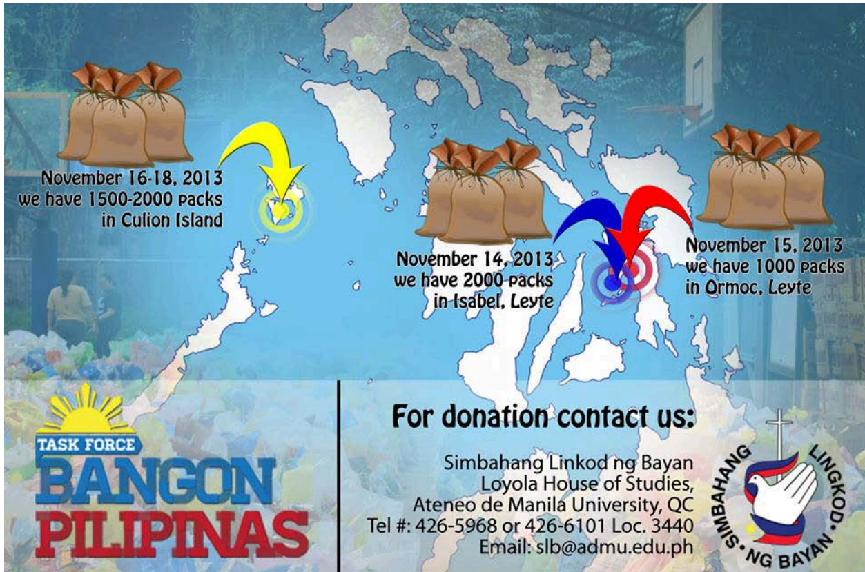
Infographic on deployment targets