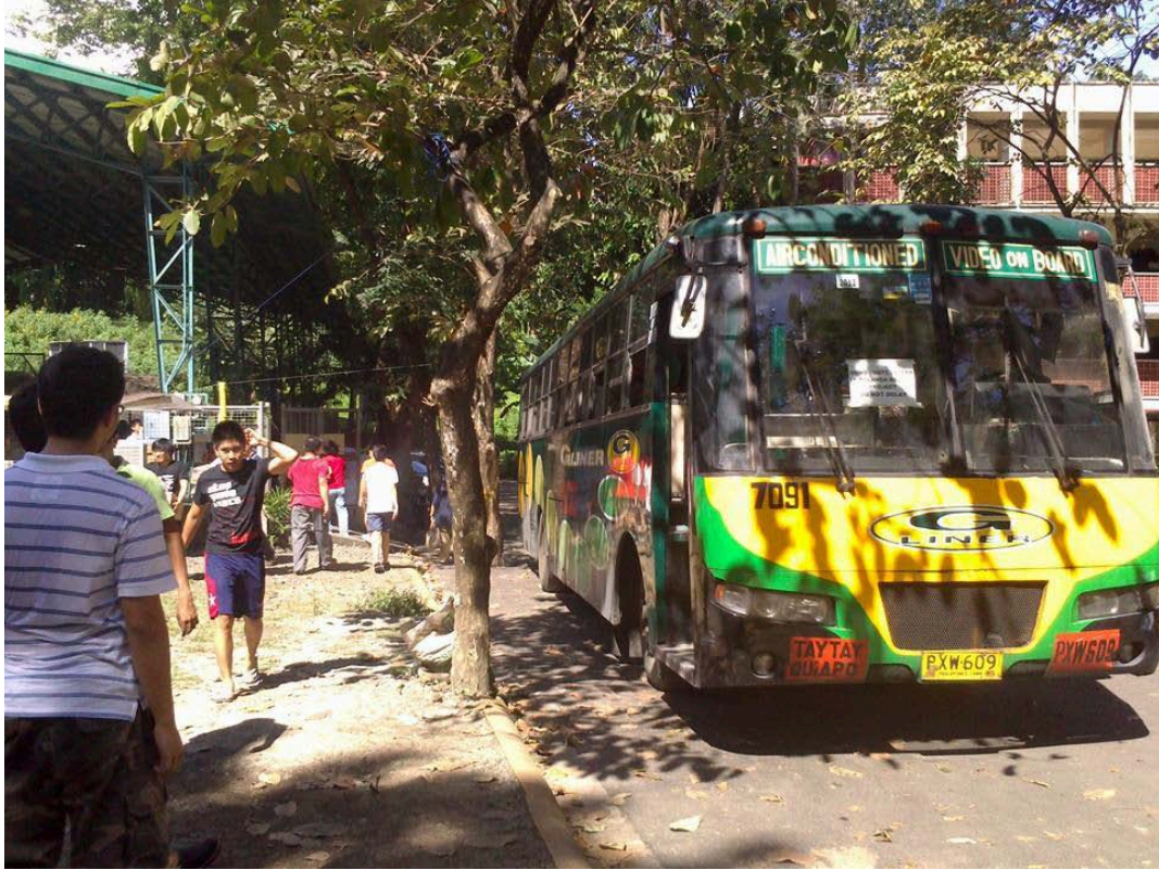
Goods being loaded to bus bound for Isabel and Ormoc, Leyte