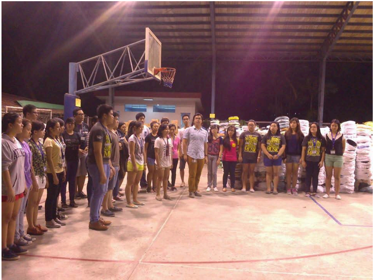
The Ateneo College Glee Club energized the volunteers with their songs.