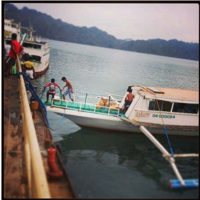
Culion relief goods delivery (from Fr. Errol Nebrao, SJ's FB)