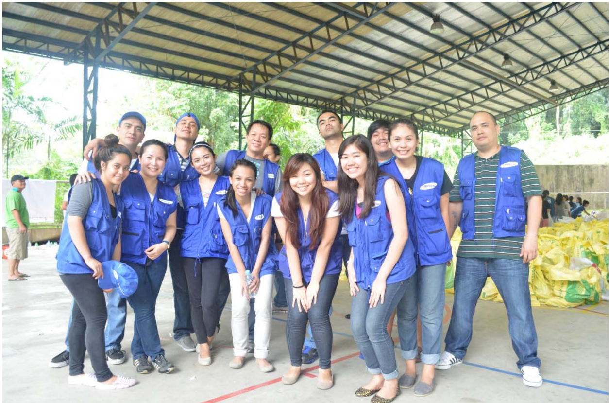
Volunteers of the Bangon Pilipinas Relief Operation. Organizations (like Samsung) and individuals come and give some of their time to repack goods or load them into the deployment trucks