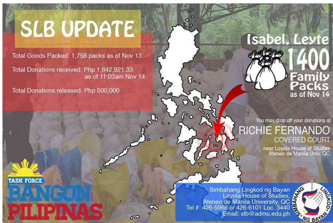
Infographic on Isabel, Leyte

The choice of Isabel, Leyte was in partnership with Tanging Yaman Foundation and private individuals who have contacts in the island who assure us of a orderly delivery of goods. We want to cater to those areas which have not been served by government, where transport is available and if there are institutional partners. So far, 2000 packs have been delivered.