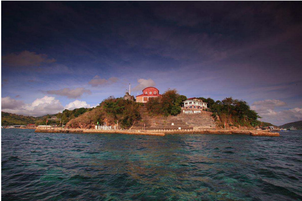
View of the Immaculate Concepcion Parish