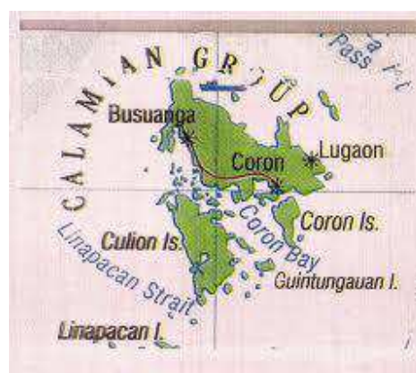
Map of Culion