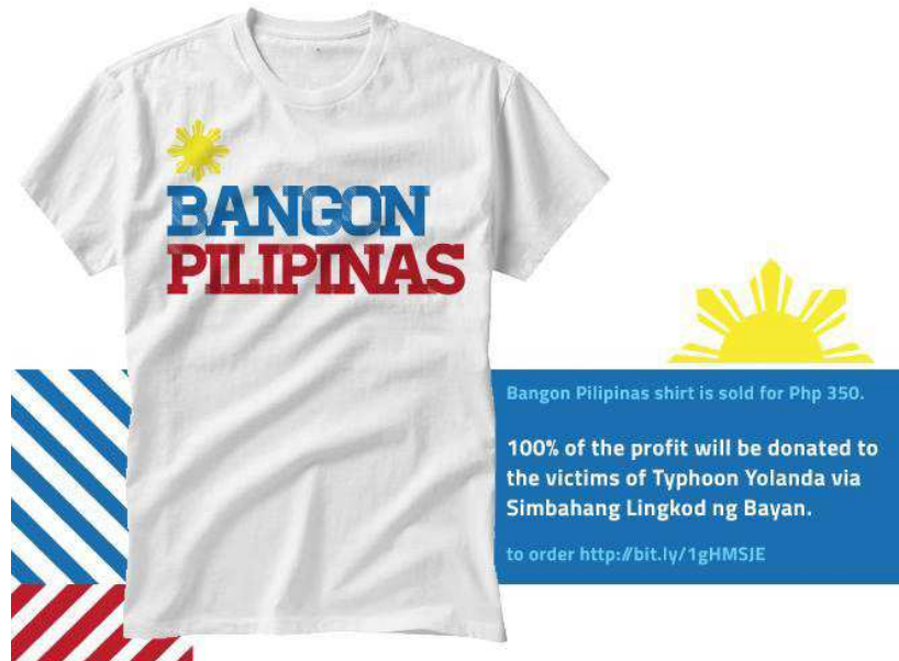
TF Bangon Pilipinas designed by volunteers